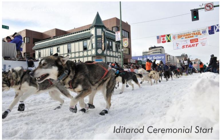
Iditarod Ceremonial Start