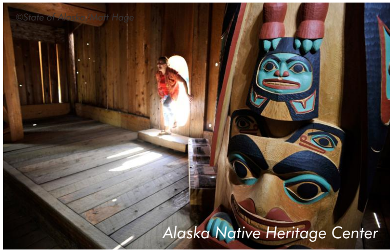
Alaska Native Heritage Center