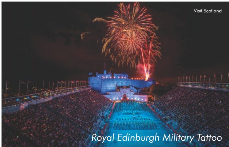
Royal Edinburgh Military Tattoo