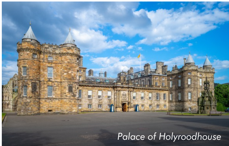
Palace of Holyroodhouse