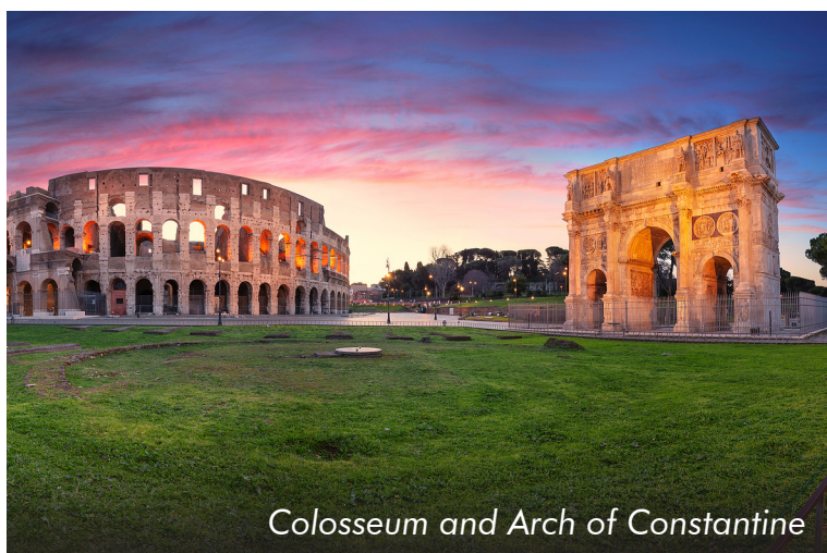
Colosseum and Arch of Constantine