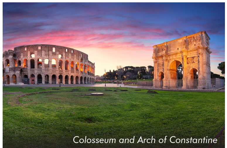
Colosseum and Arch of Constantine