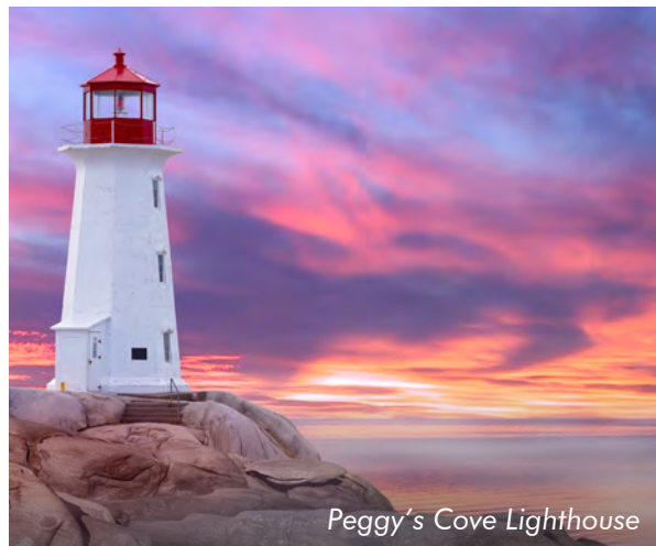
Peggy's Cove Lighthouse