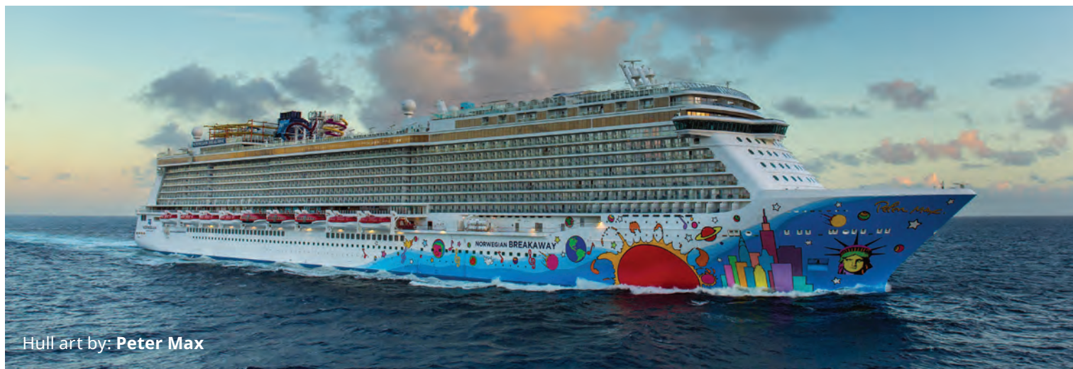
Hull art by: Peter Max

Refurbished: 2020 • Built: 2013 • Gross Tonnage: 145,655 • Guests (Double Occupancy): 3,963 • Overall Length: 1,068ft • Max Beam: 170ft • Crew: 1,657