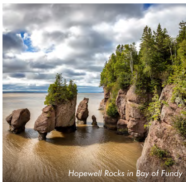
Hopewell Rocks in Bay of Fundy