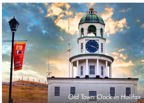
Old Town Clock in Halifax