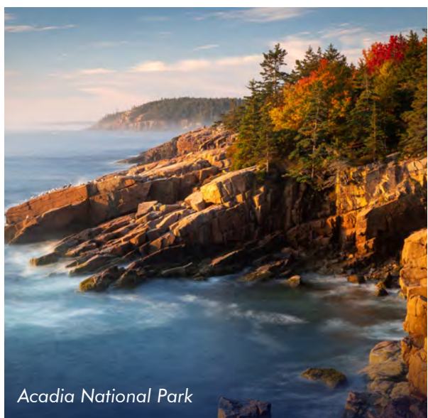
Acadia National Park