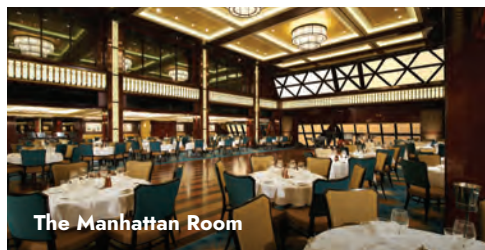
The Manhattan Room

One of three Main Dining Rooms, The Manhattan Room is where guests can enjoy specially curated modern and classic dishes made with the freshest ingredients. Seating capacity: 630