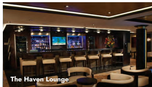
The Haven Lounge

Exclusive to guests of The Haven, you can enjoy your favorite cocktail and light bites while surrounded by true luxury. Seating capacity: 39