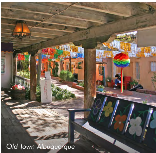
Old Town Albuquerque