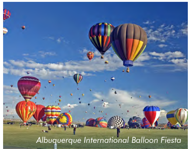
Albuquerque International Balloon Fiesta