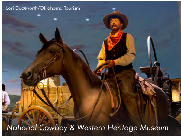
National Cowboy & Western Heritage Museum