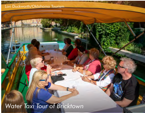
Water Taxi Tour of Bricktown