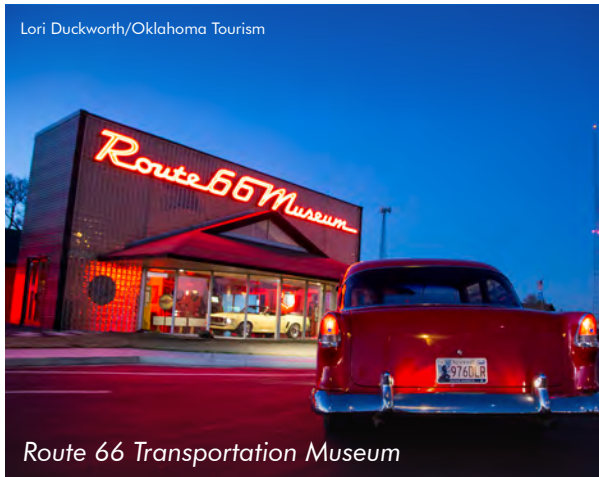
Route 66 Transportation Museum