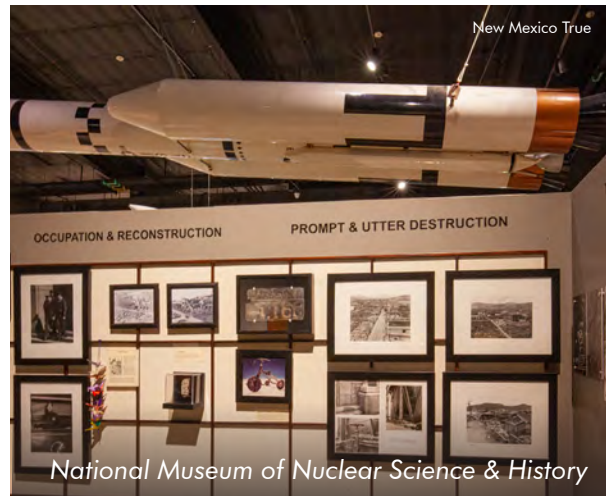
National Museum of Nuclear Science & History