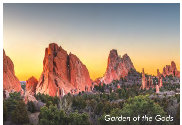
Garden of the Gods