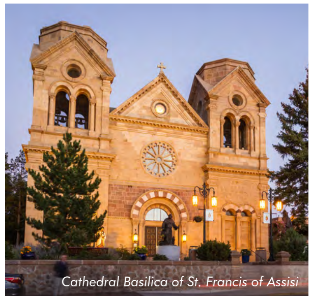
Cathedral Basilica of St. Francis of Assisi