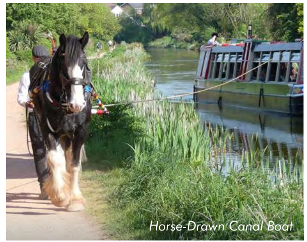
Horse-Drawn Canal Boat