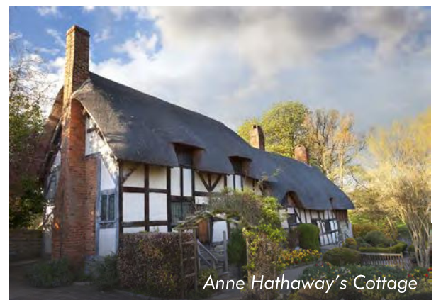
Anne Hathaway's Cottage