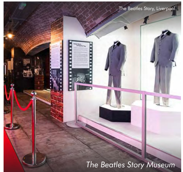
The Beatles Story Museum