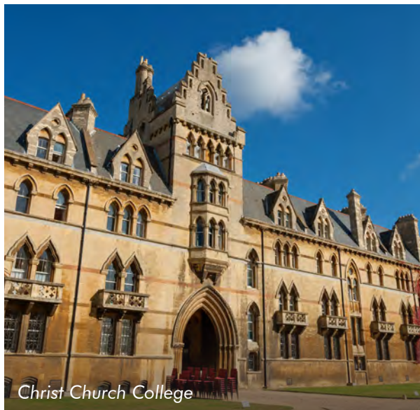
Christ Church College