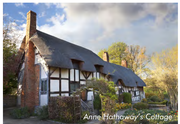
Anne Hathaway's Cottage