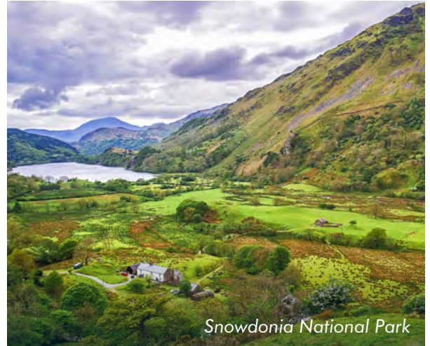
Snowdonia National Park