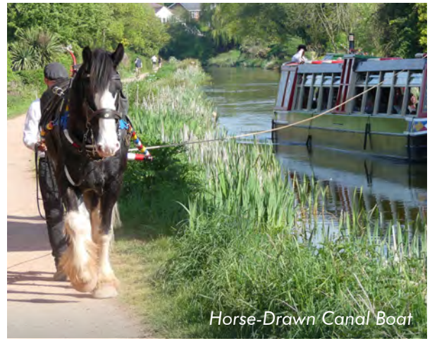
Horse-Drawn Canal Boat

Following breakfast, we will transfer to the airport for our flight home.