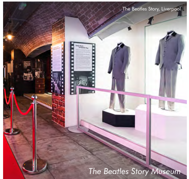
The Beatles Story Museum