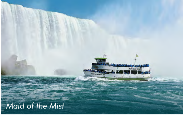
Maid of the Mist