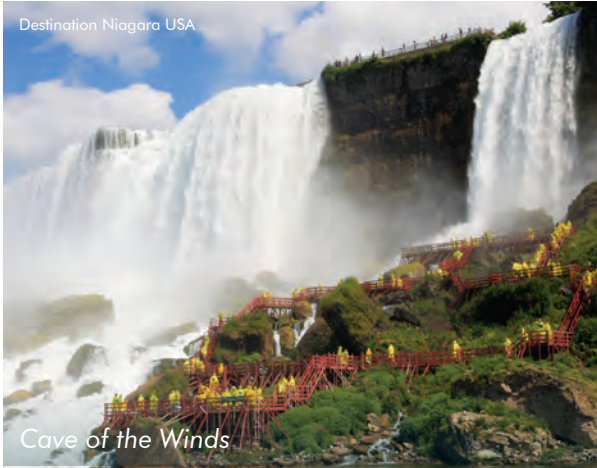
Cave of the Winds