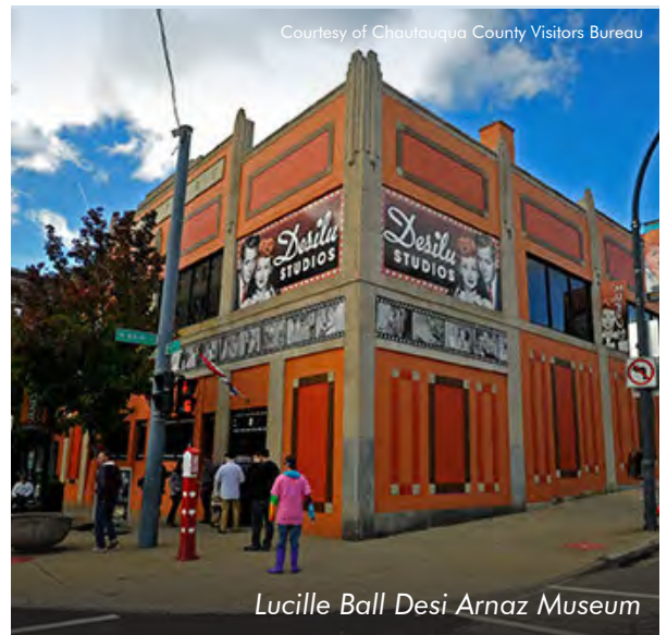
Lucille Ball Desi Arnaz Museum

Bid farewell to Buffalo this morning as you board your flight home.