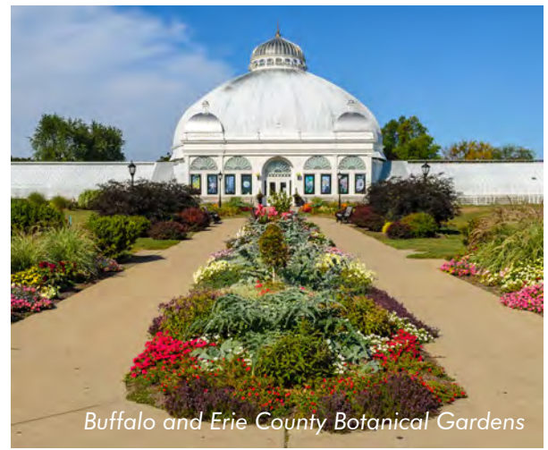
Buffalo and Erie County Botanical Gardens