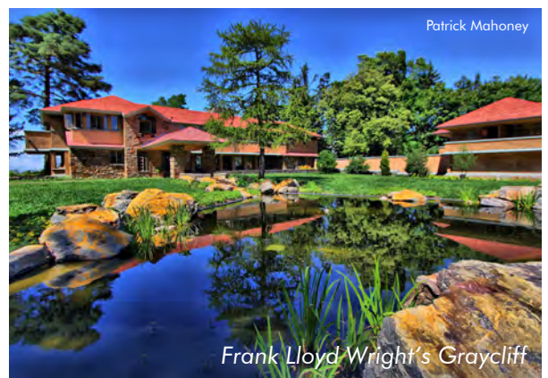
Frank Lloyd Wright's Graycliff