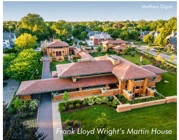
Frank Lloyd Wright's Martin House

After breakfast, travel along the shores of Lake Erie to visit Frank Lloyd Wright's Graycliff , a breathtaking estate that beautifully reflects Wright's philosophy of blending architecture with nature through open spaces, expansive windows, and seamless indoor-outdoor design. Learn about the Gray family and the innovative vision behind this lakeside retreat before continuing to Jamestown, the birthplace of Lucille Ball. Enjoy a group lunch in the lively Tropicana Room at the Lucille Ball Desi Arnaz Museum , then explore fascinating exhibits filled with costumes and memorabilia celebrating the legacy of Lucy and Desi. The laughter continues at the interactive National Comedy Center , where multimedia displays and hands-on exhibits honor legendary comedians past and present. Return to Buffalo this evening to relax before gathering for a memorable farewell dinner, the perfect finale to an unforgettable journey.