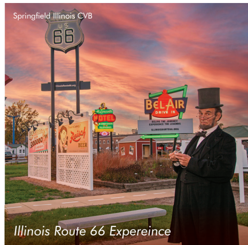
Illinois Route 66 Experience