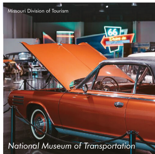
National Museum of Transportation